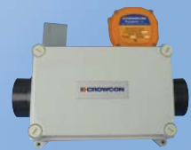
Sampling Device control for Crowcon's Environmental Sampling Unit