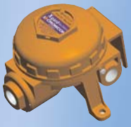
Industry-standard gas detectors