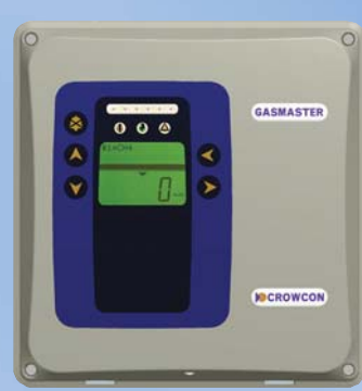
Gasmaster 1 control panel for one gas detector, fire zone or Environmental Sampling Unit.