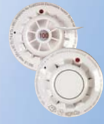
Up to 20 fire/heat detectors per zone